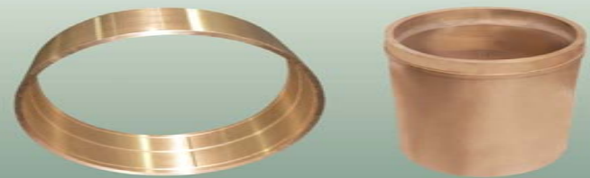
Over size Ring & Bush