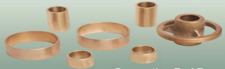
Connecting Rod Brass