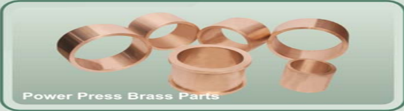
Power Press Brass Parts