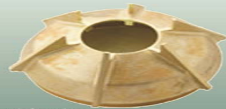
Gun Metal Casting